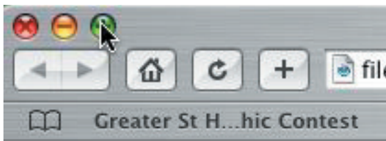
Fig. #1 Expand Button

You will be watching the tutorials to learn about the program. As you watch the tutorial you will need to do many of the things that the tutorial shows you. However, you will want to stop the movie to do what they want you to do. The tutorial has a control bar at the bottom that you can use to pause the movie when needed. When you first open the program it usually hides the control bar. Let's make the make the window bigger by either clicking on the green "Expand" button in the upper left of the window (see Fig. #1). Or by dragging the bottom right corner of the window out to make the window as large as you need to see the movie controls (see Fig. #2). Now you will be able to control the movie so that you can Pause it at times to work in AM.