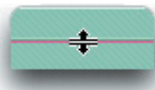
Fig. #2 Sound Level Cursor

Now do a Screen Shot showing the use of the Pen tool and the red dots to change the sound level of part of an Audio track.