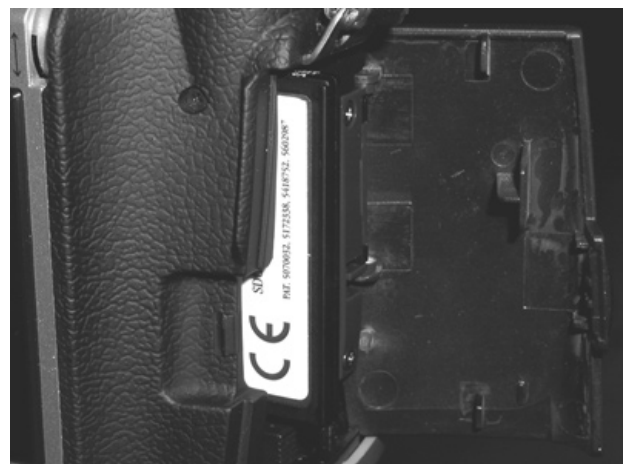
Fig. #2 Canon card door